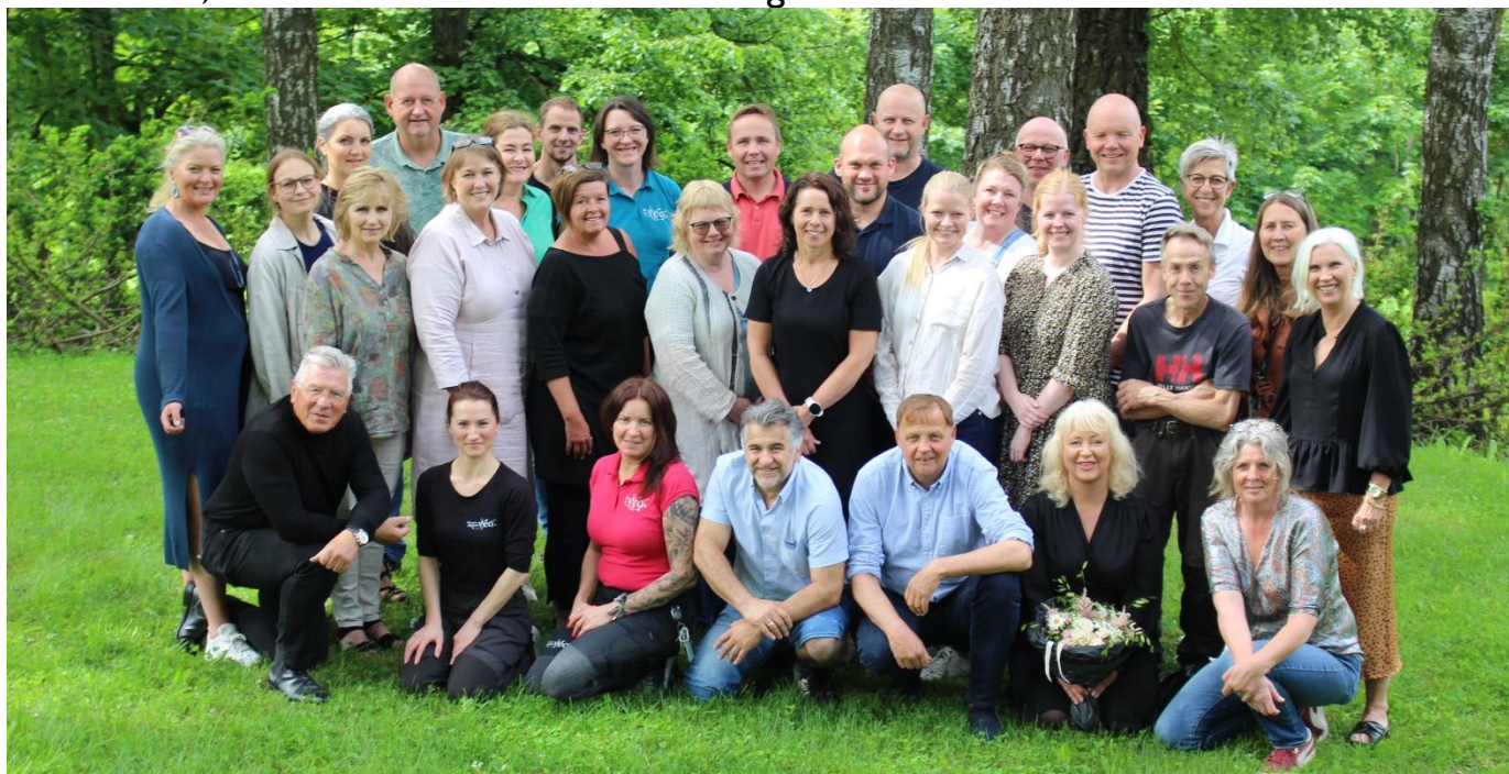
All employees at Vea, June 2022.

Vea has a total of 36 employees who work with teaching, operation, maintenance and administration. On Vea's website, all employees are presented with a picture, contact information, education and work area/teaching area.