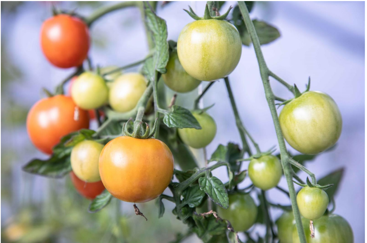
Tomatoes produced at Contents Vea.

In the canteen, there are heavily subsidized prices for the enjoyment of you who are students. When you buy a coupon, you get a subsidized price for lunch and dinner. It is only possible to pay by card in the canteen (no cash or credit card).