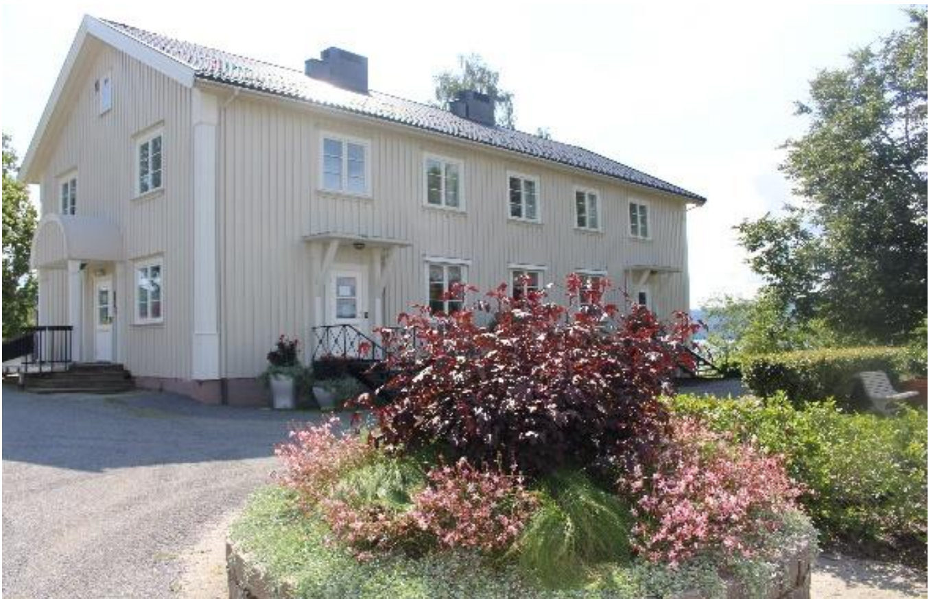
The canteen is inside the "Kitchenbuilding"..

The canteen opens at 8.00 and closes at 16.30. Everyone's welcome to come sit down and relax. It is only possible to pay by card in the canteen.