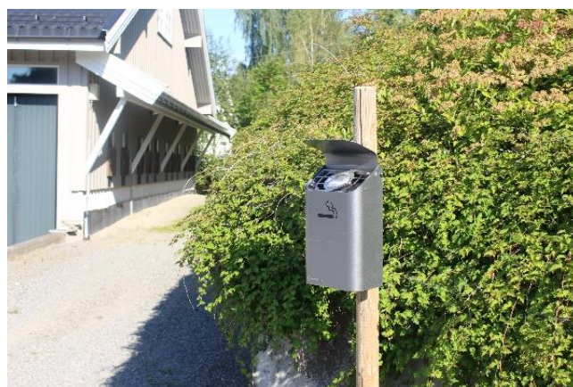
Smoking is allowed two different places at Vea.