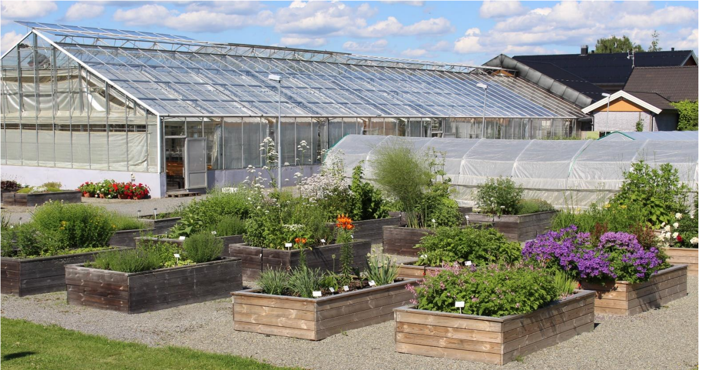
Perennials, herbs and historic plants are collected here..