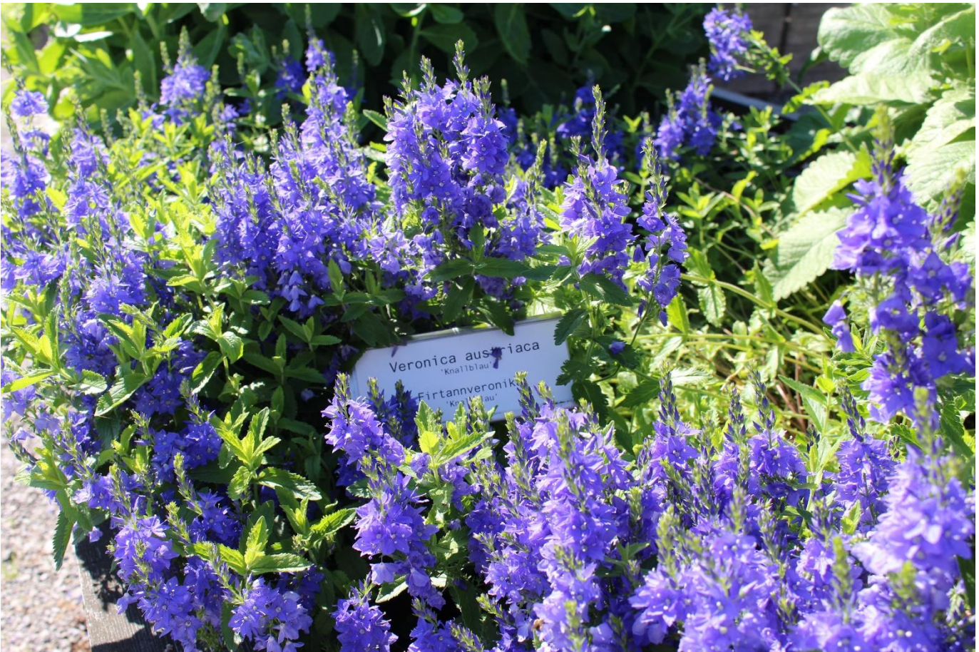
Syllabus plants are labeled with Norwegian and botanical names.