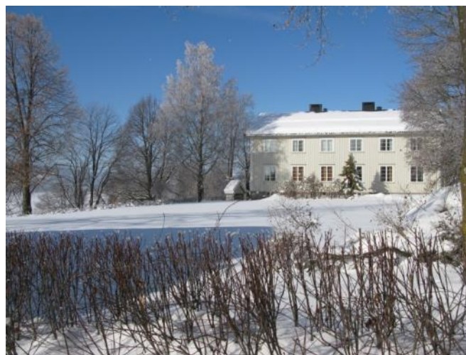
The «Kitchen building»